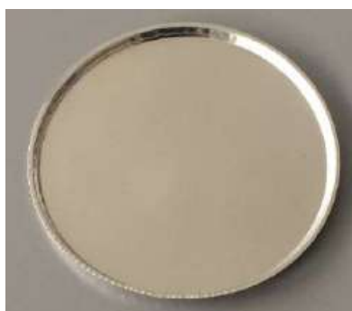
Aluminium Pan for Moisture Analyser