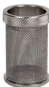
USP App. 1 Baskets (10/20/40/60/100 Mesh sizes available)