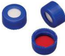
Blue Screw Cap | White PTFE | RED Silicon Septa | Bonded/ Non-bonded 9 MM