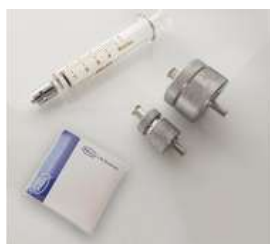
Solvent Filtration Kit