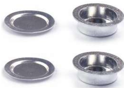
DSC/ TGA Aluminium Pans