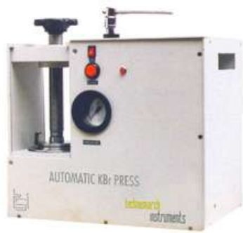
KBR Press (Automatic)