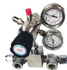
Gas Manifold with regulator