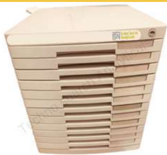
Column Storage Cabinet | ABS Plastic | 6/ 12 drawers