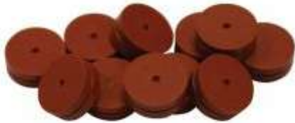
GC Injector Sepa (20mm)