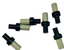
SS Cannula Filter (10 µm) with adapter (Pack of 6)