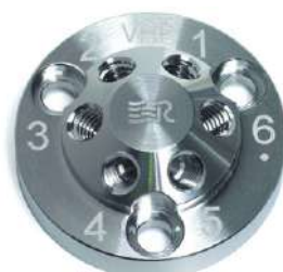
Stator head | Autosampler spare