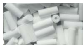
Disposable Cannula Filter 10 µm (Pck of 100)