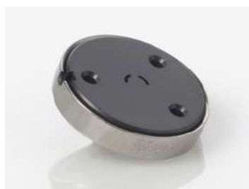
Rotor Seal(600 bar) | Autosampler spare