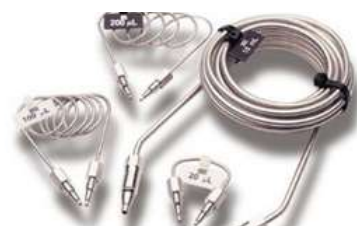
Rheodyne Sample Loops | PEEK/ SS