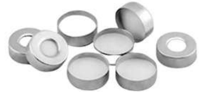
Aluminium Crimp Cap | White & White/ Beige PTFE Silicon Septa (20 MM)