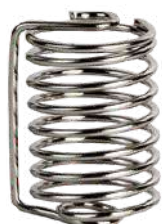
Helix/Spiral Type sinkers(Available in all sizes)