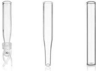
MICRO INSERTS (HPLC Vial)