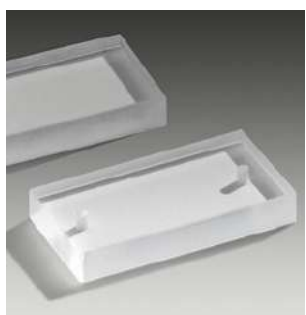
Rectangular KBR windows