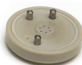
Stator phase | Autosampler spare