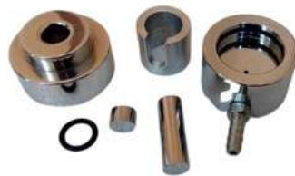
KBR Die Set