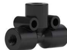
High Pressure PEEK Tee for LCMS-UPLC. 1/16" OD tubing.