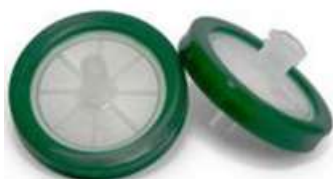
PTFE/ Nylon/ PVDF Syringe Filter 13mm / 25 mm; 0.22µm/0.45 µm (100 pcs/ pck)