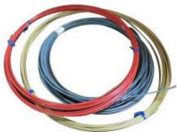
PEEK Tubing, ID 0.5/0.25/0.75/ 1.0 mm, OD 1/16