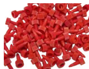
Column End Plug