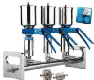
Vacuum Filtration Manifold | 3 stage/ 6 stage