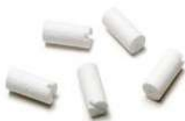
Frits for Agilent HPLC Systems (1 PK 5 nos)