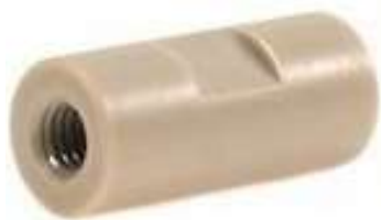
Peek Union . Available in Bore size; 0.25, 0.5 & 0.75 mm