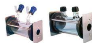
Gas Cell (NaCl/ KBR)