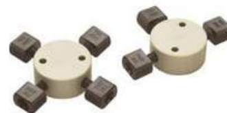
Peek Tee & Crosses