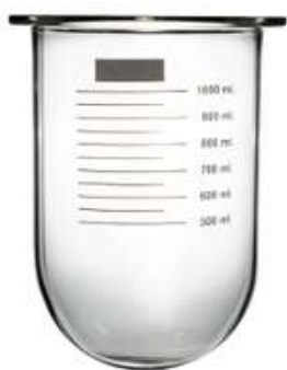
DISSOLUTIONS VESSEL CLEAR 'E' TYPE- 1000ml