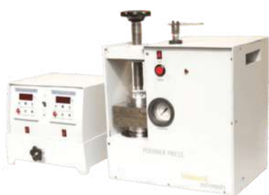
POLYMER PRESS Manual/ AUTOMATIC - 15/30 TON