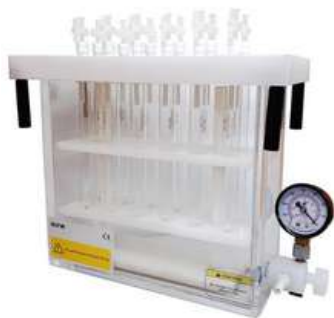
Solid Phase Extraction(SPE) manifold | 12/ 24 port