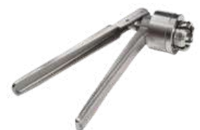
Manual Crimper | Decrimper (Imported)