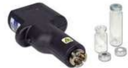
Electronic Crimper | Decrimper (Imported)