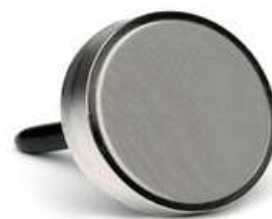
Solvent Filter (SS 316) for HPLC (Agilent Type)