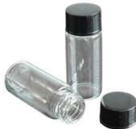
Tubular Sample storage Vials | 2/5/10/20 ml