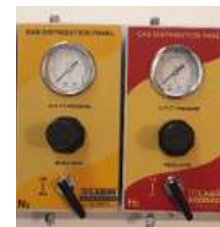
Gas distribution and selection Panel