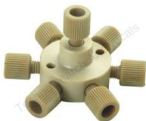
7 Port PEEK Manifold | 1/16"OD tubing