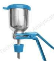
SS Filter Holder (Duck Clamp type)