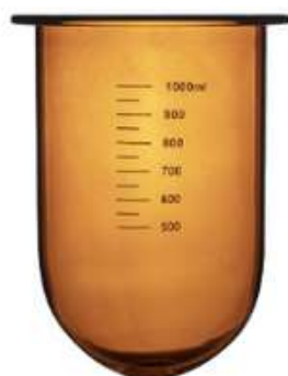
DISSOLUTION VESSEL AMBER 'E' TYPE - 1000ml