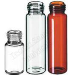
TOC/EPA Vials and Closures | 20ml / 40 ml