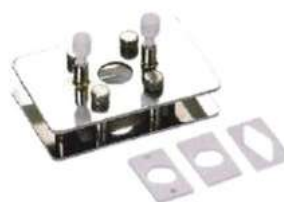
FTIR Liquid sampling