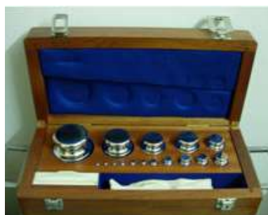
F1/E2/A class standard weight box (1 mg – 200 g)