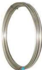
SS 316 Tubing 1/16" X 0.18/0.13/0.25/ 0.5 MM ID