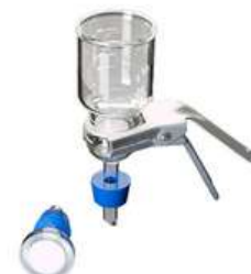
Glass Filter Holder | Filter size: 25mm, 47mm, 90 mm