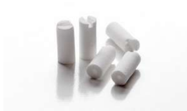
PTFE Frit | Pump accessory| 5 nos/ pck