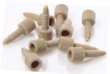
1/16" PEEK FINGER TIGHT FITTING, MACHINED. (Pack of 10)