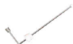
Sampling Canulas available(Fixed height/ Adjustable)