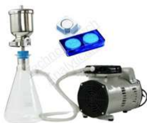
HPLC solvent filtration kit