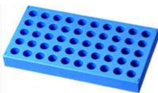
2 ml HPLC vial Rack (Imported)