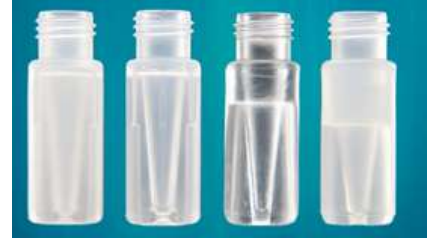
PP SCREW TYPE INSERT VIALS