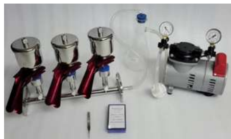
Vacuum Filtration Manifold Kit