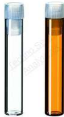
Shell Vials - 1ml Glass/PP, 8mm Pe-Plug (8.2mm x 40mm)