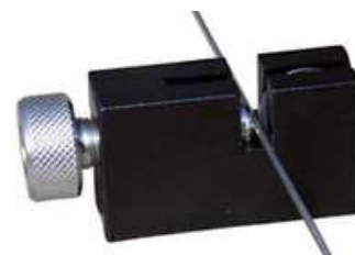
SS Tubing Cutter