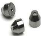
Graphite Ferrules 0.5/0.8/1mm (1 PK 10 nos)