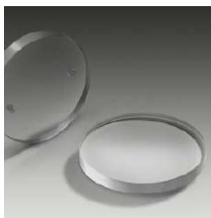
Round KBR windows