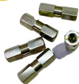
1/16" FEMALE SS 316 UNION WITH ZERO DEAD VOLUME