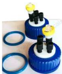
HPLC Safety Bottle Caps | 3/ 4 port