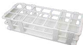
20ml GC Vial Rack (Imported)