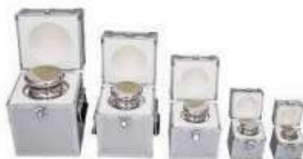
Individual weights (500 g to 20 kg) M1 class standard weights NABL certificate