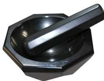
MORTAR & PESTLE