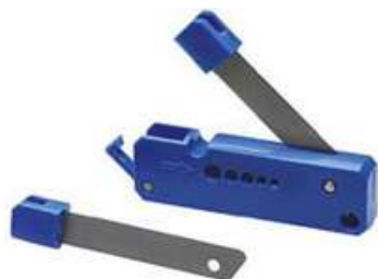
PEEK Tubing Cutter