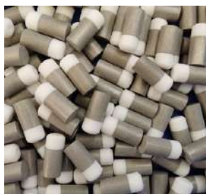
Solvent Filter for HPLC (Shimadzu Type)