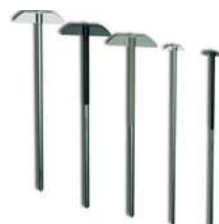
Paddle [Available for 110/250/1000mL (SS)]